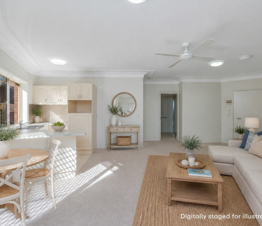
Digitally staged for illustration